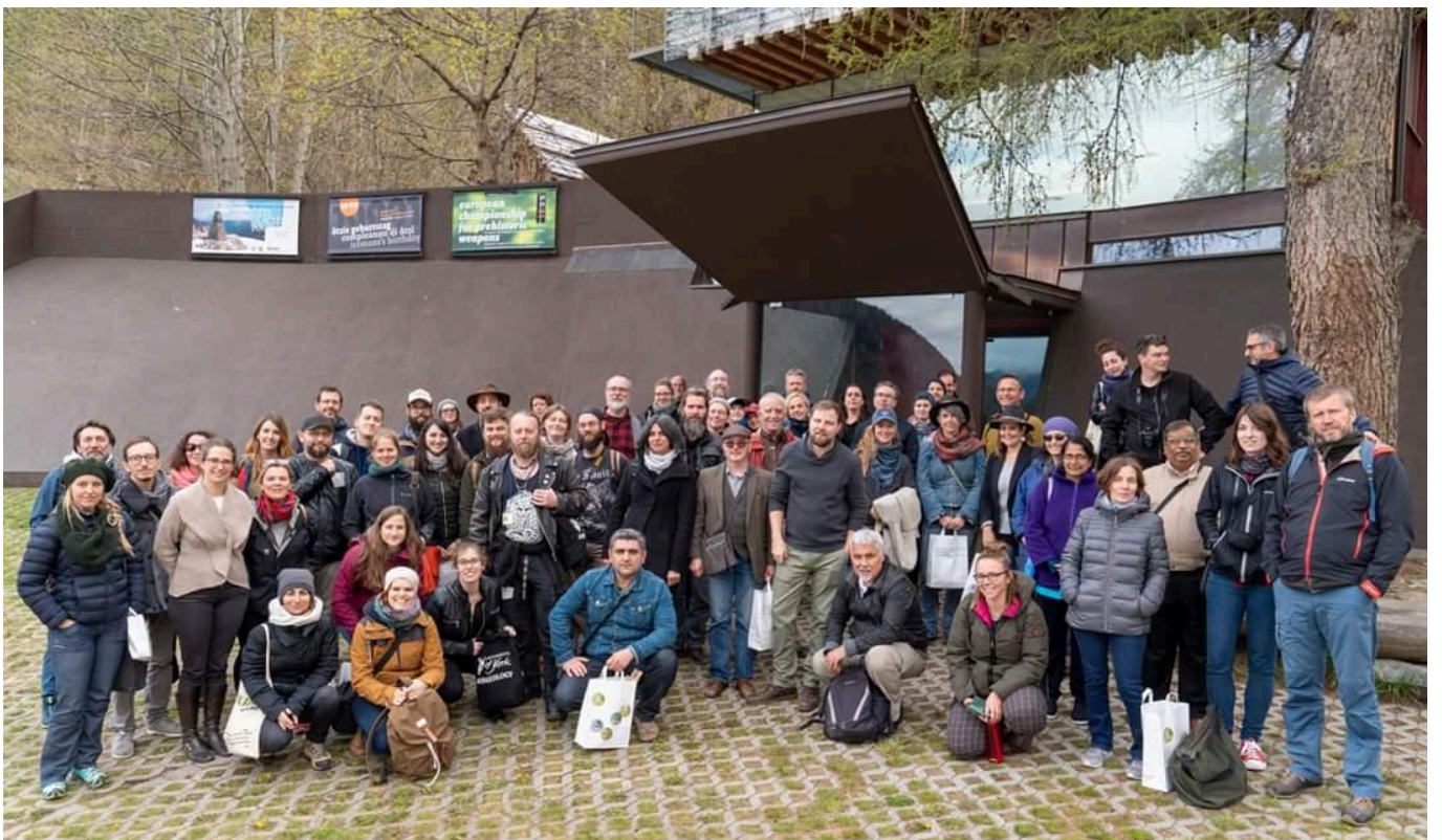
FIG 4. EXCURSION 1- BOLZANO