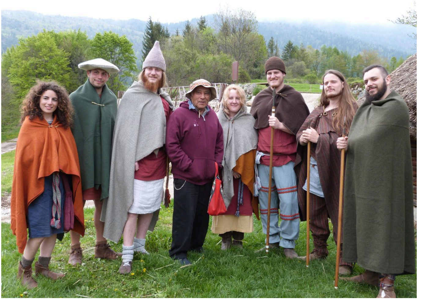
FIG 8. EXCURSION 2 - BOSTEL DI ROTZO.