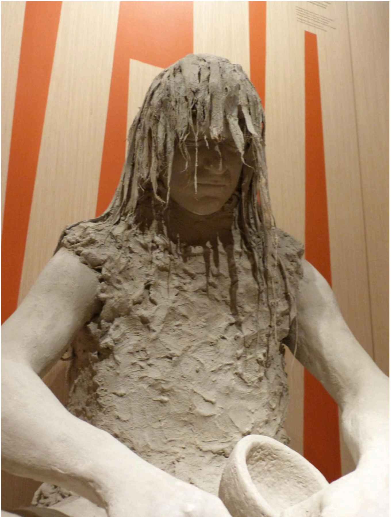
FIG 7. EXCURSION 2 - THE ARCHAEOLOGICAL MUSEUM AT FIAVÈ.