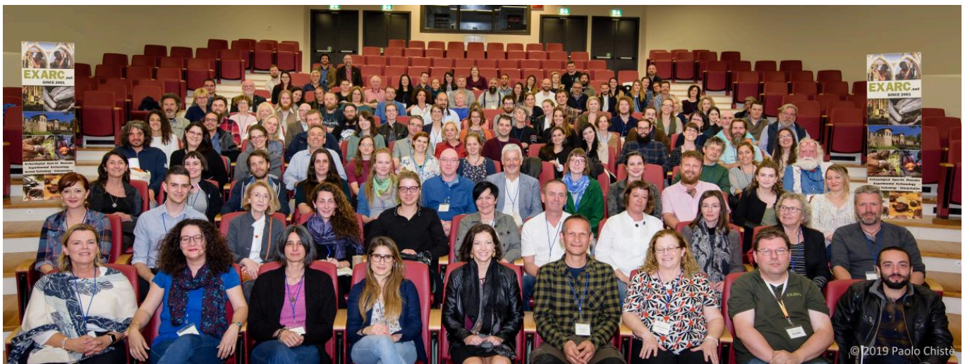
FIG 2. GROUP PHOTO.