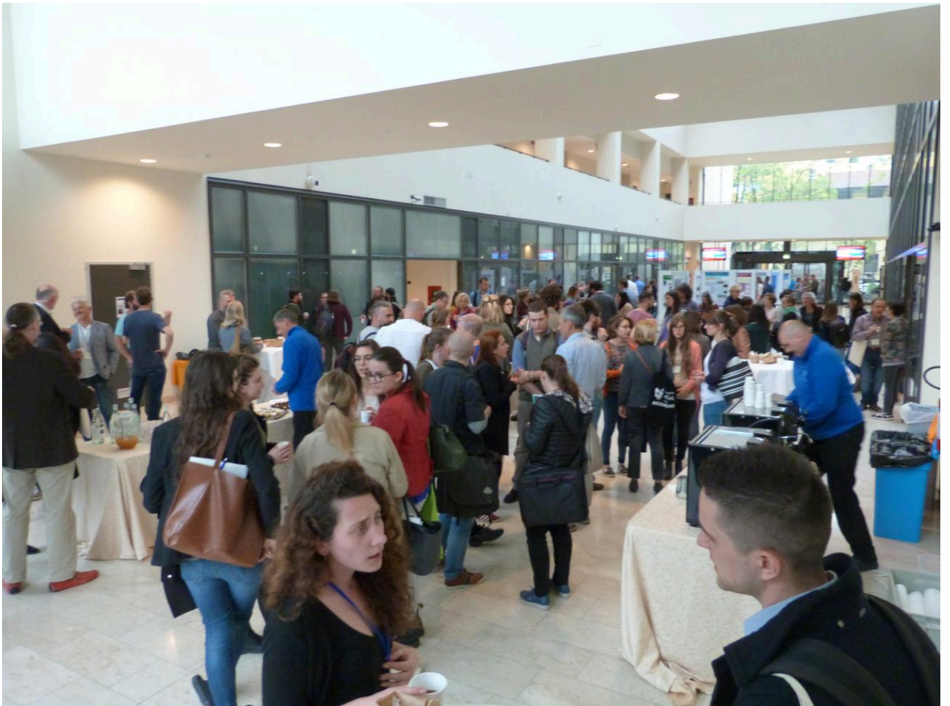
FIG 3. COFFEE BREAK.