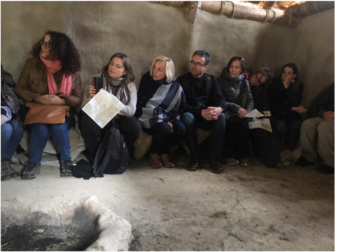
FIG 5. EXCURSION 1 - ARCHEOPARC OF VAL SENALES.