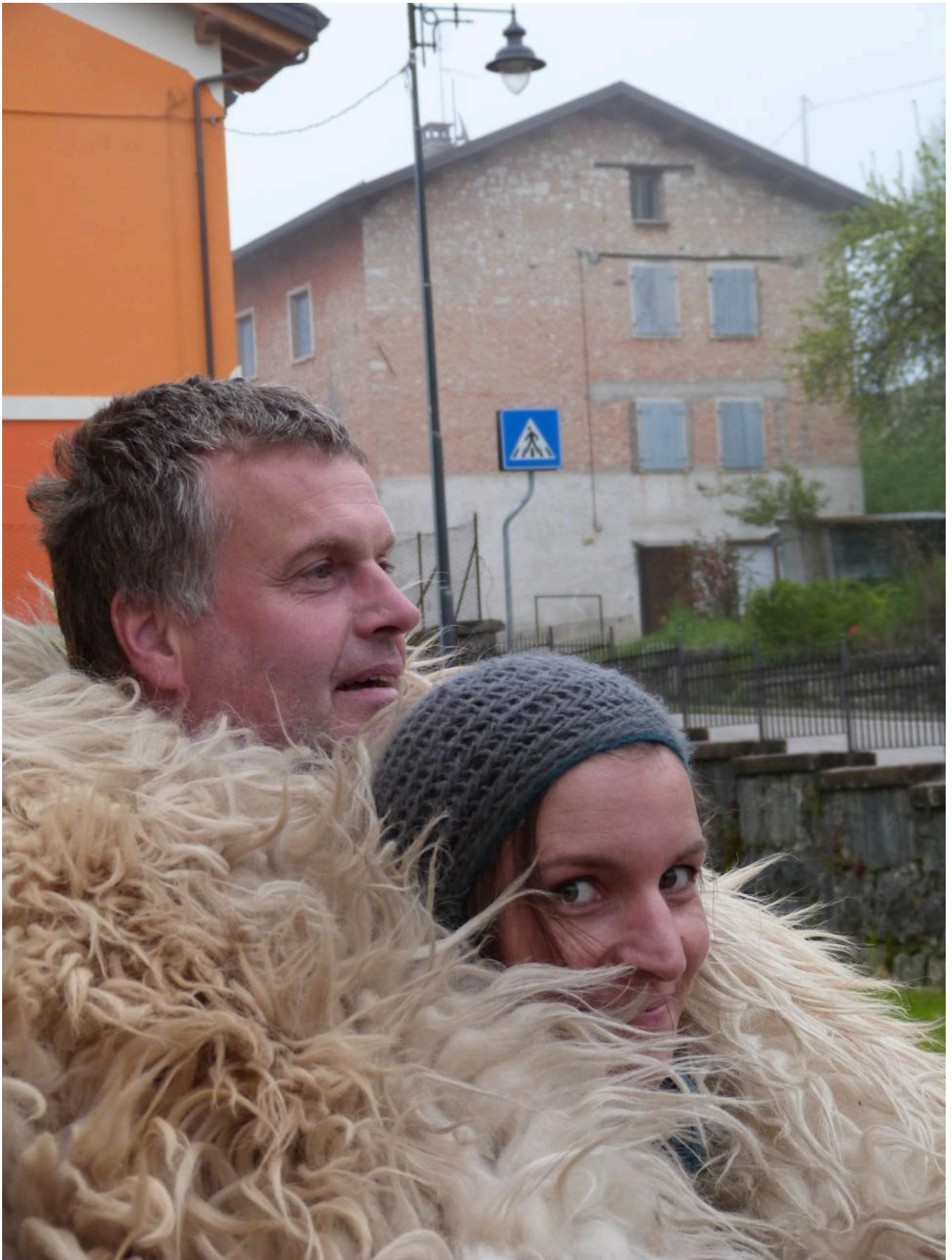
FIG 9. EXCURSION 2 - BOSTEL DI ROTZO.