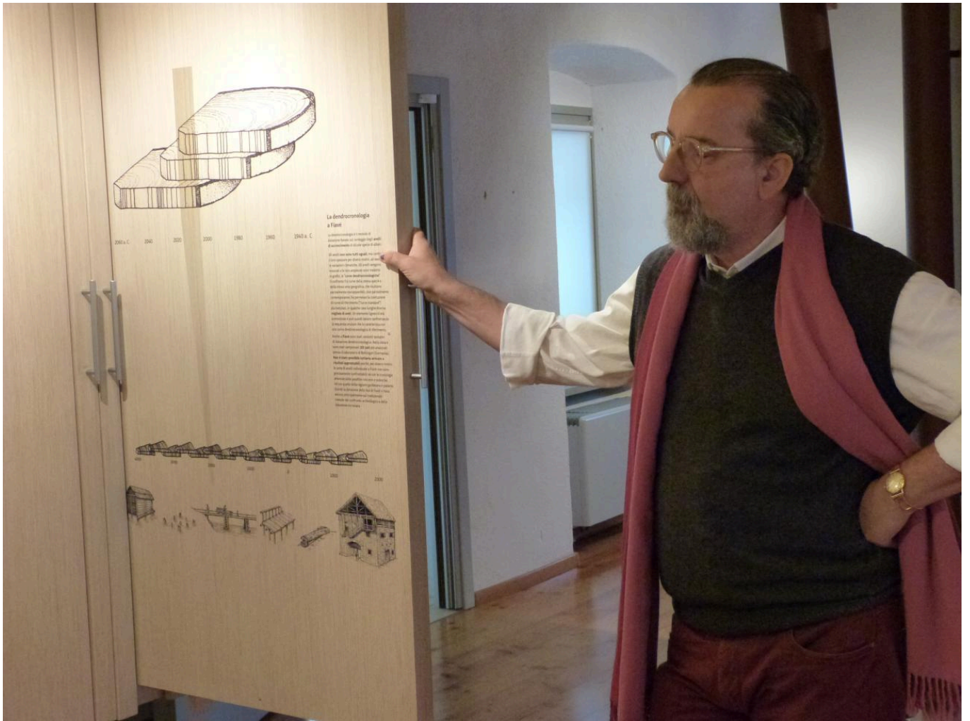
FIG 6. EXCURSION 2 - THE ARCHAEOLOGICAL MUSEUM AT FIAVÈ.